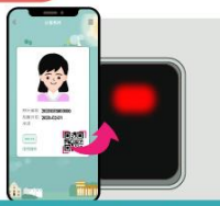
Photo for identification documents in "My Photos" of "Macao One Account"

After successful submission, the relevant photo will be sent to DSI for follow-up processing. Residents do not need to visit service counters.